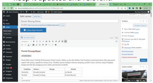
Figure 2. Adding and Editing Content

Adding and editing content: As an admin, you can add new pages, posts, and media to the website. You can also edit existing content to keep it updated and relevant.