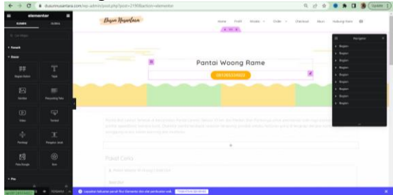
Figure 4. Customizing the Website

3) Customizing the website: WordPress CMS allows users to customize the website's appearance and functionality. You can install and activate themes and plugins, configure settings, and add custom code.