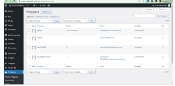
Figure 3. Users Management

Managing users: You can manage user roles and permissions, add or delete users, and control their access to different areas of the website.