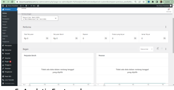
Figure 5. Analytic Featured

4) Analyzing website performance: use tools like Google Analytics to track website traffic, user behavior, and other important metrics. This data can help Users make informed decisions about improving the website's performance.