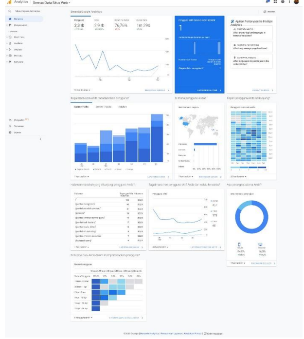
Figure 9. Google Analytics

Google Analytics can be used to determine the growth of website traffic [16], Based on the results of Google Analytics for the last 90 days, it can be concluded that the implementation of SEO on the Dusun Nusantara web-based application has succeeded in increasing the number of users and sessions on the application. During this period, the number of users reached 2,300 people and the number of sessions reached 2,900, indicating an increase in user interest in visiting the application. Although the bounce rate of 76.76% is quite high, the average session duration of 1 minute 29 seconds indicates that users are interested in exploring pages in the application.