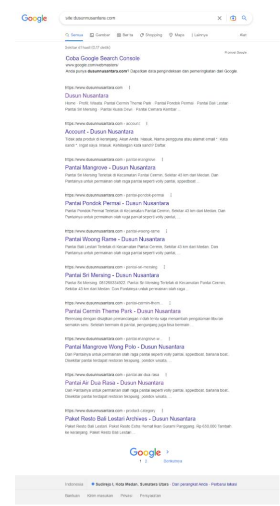
Figure 8. SERP display after SEO is applied