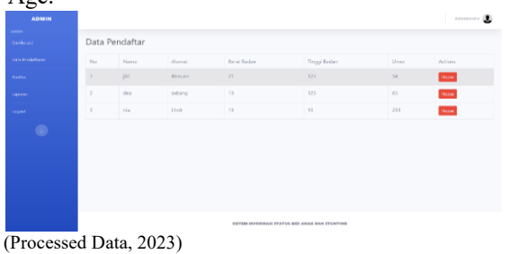
Figure 3 Registrant Data

The data page displays the registrant data for each patient, where the data displayed is registrant data such as 'Name,' 'Address,' 'Weight,' 'Height,' and 'Age.'